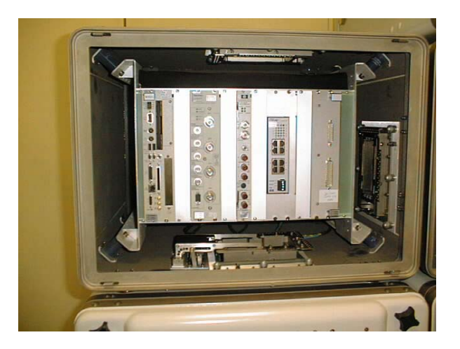
Fig. 2. CORE Case A4 with VXI Mainframe

The stimulus resources not available in VXI format are implemented using "rack & stack" instruments. This is the case for DC & AC Power Supplies, High Power Loads, Spectrum Analyzer and Rubidium Clock and Video Pattern Generator.