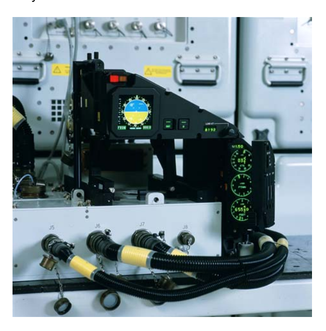
Fig. 6. GPATE TPS: UUT & Holding Fixture

GPATE TPS embrace many technologies, including computers, displays, communications, navigation (MLS RNAV, DME, etc) and others. First delivery of 3 GPATE Systems to the three participant nations (UK, SP & IT) is scheduled for May 2006.