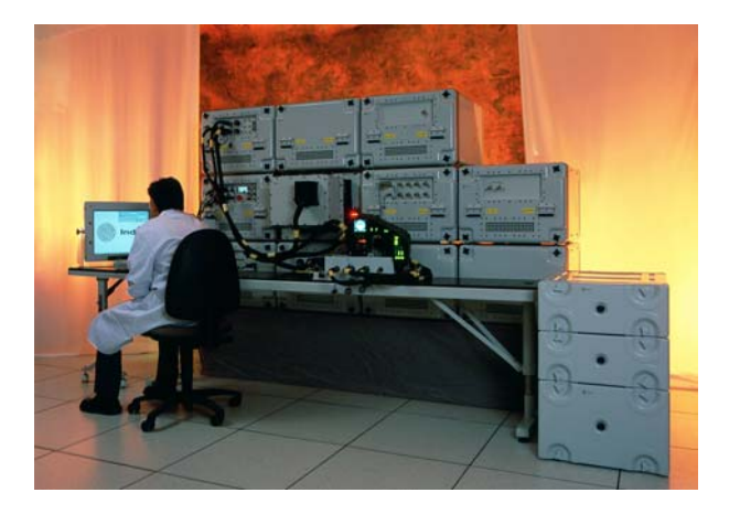
Fig. 1. GPATE System in Operation Mode

The GPATE tester (called the CORE) is a General Purpose ATE entirely designed and produced by INDRA. It is based on Commercial of the Shelf (COTS) instruments, allocated in rugged cases, most of which are around 40 Kg weight. Designed for use in the field, it is composed by 11 operational boxes made of carbon fibre, strong enough to meet the environmental requirements while minimising weight. The cases include either rugged chassis to hold either VXI cards or 19" standard instrumentation.