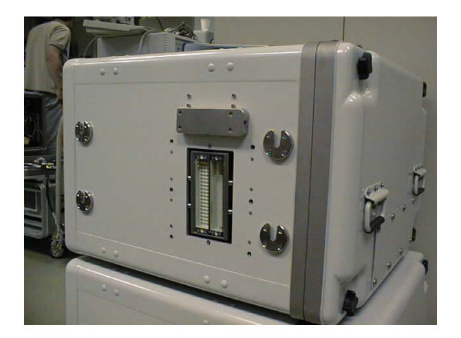
Fig. 5 . Example of Case Side with Floating Blind Mate and Alignment Pins (Female Type).

When the cases are mounted, the blind mate connectors are engaged one by one. Any missing engagement is detected and identified by ECS at system start-up. Power will be never applied to the system if there is any missing connection.